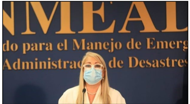
La gobernadora Wanda Vazques Garced

Igualmente, sostenemos que el cierre de los domingos es una medida similar que opera en contra de las medidas recomendadas por la comunidad científica. Este tipo de medidas no toman en cuenta que la mayoría de la clase trabajadora de este país vive de día a día y no están en condiciones de hacer compras para un mes como pueden hacer los sectores más privilegiados del País.